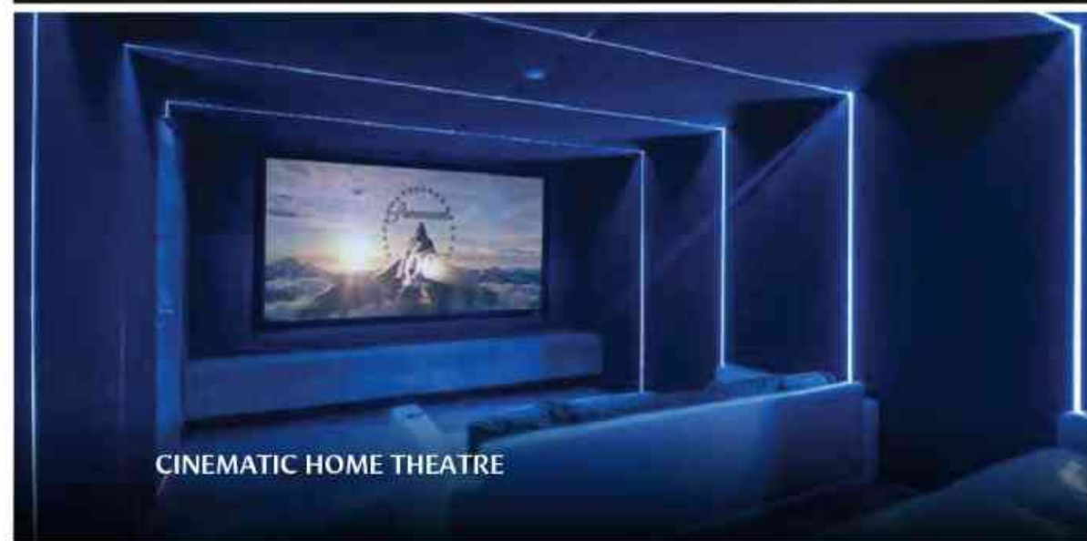
CINEMATIC HOME THEATRE