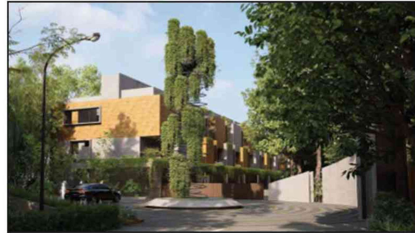
GRAVITY Smera Gardens | 12 Acres, 3 & 4 BHK, 174 Units Chandapura, Bengaluru