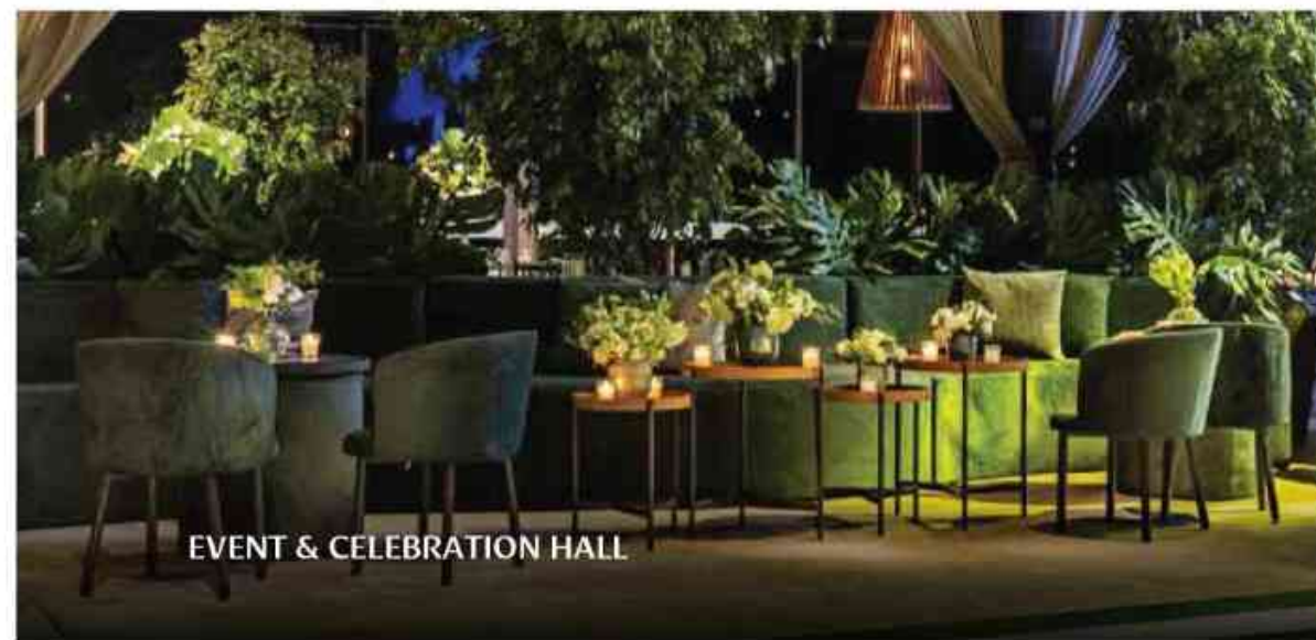
EVENT & CELEBRATION HALL