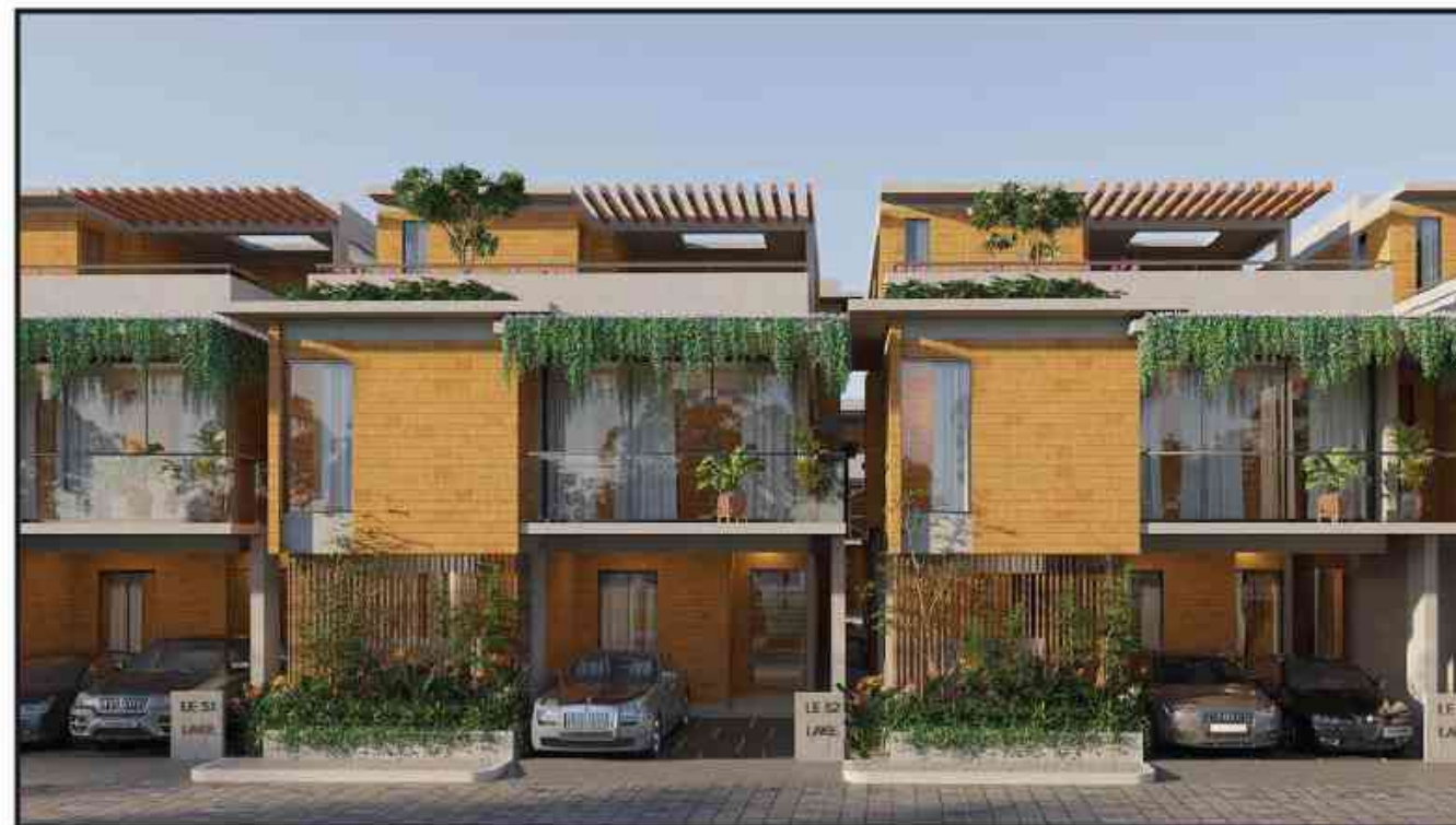
GRAVITY Lake Estates | 15 Acres, 200 Units Rajanukunte, Yelahanka