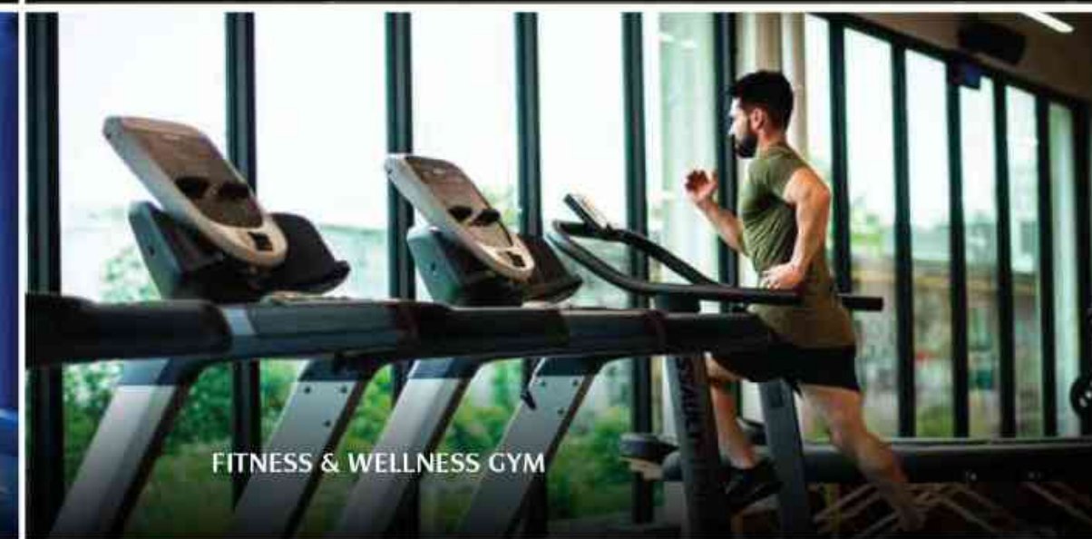
FITNESS & WELLNESS GYM