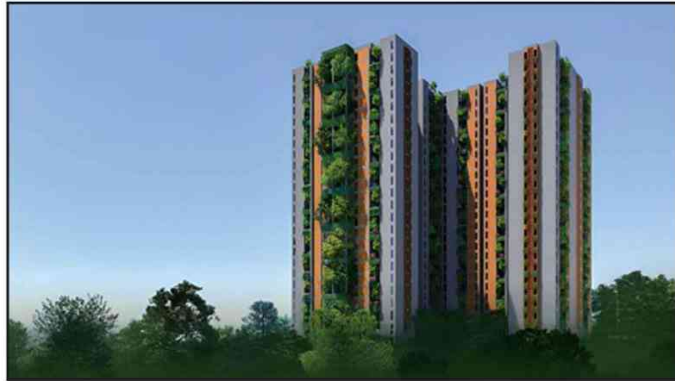
GRAVITY Thanisandra | 3.8 Acres, 3 Towers, 27 Floors, 286 Units Thanisandra, North Bangalore